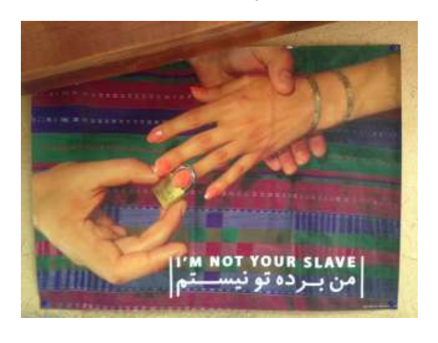
Sample of trainee's work (1)