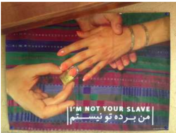
Sample of trainee' s work (1)