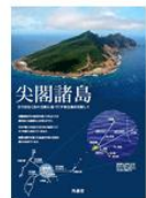
▶ Leaflet: Japan's Position on the Senkaku Islands